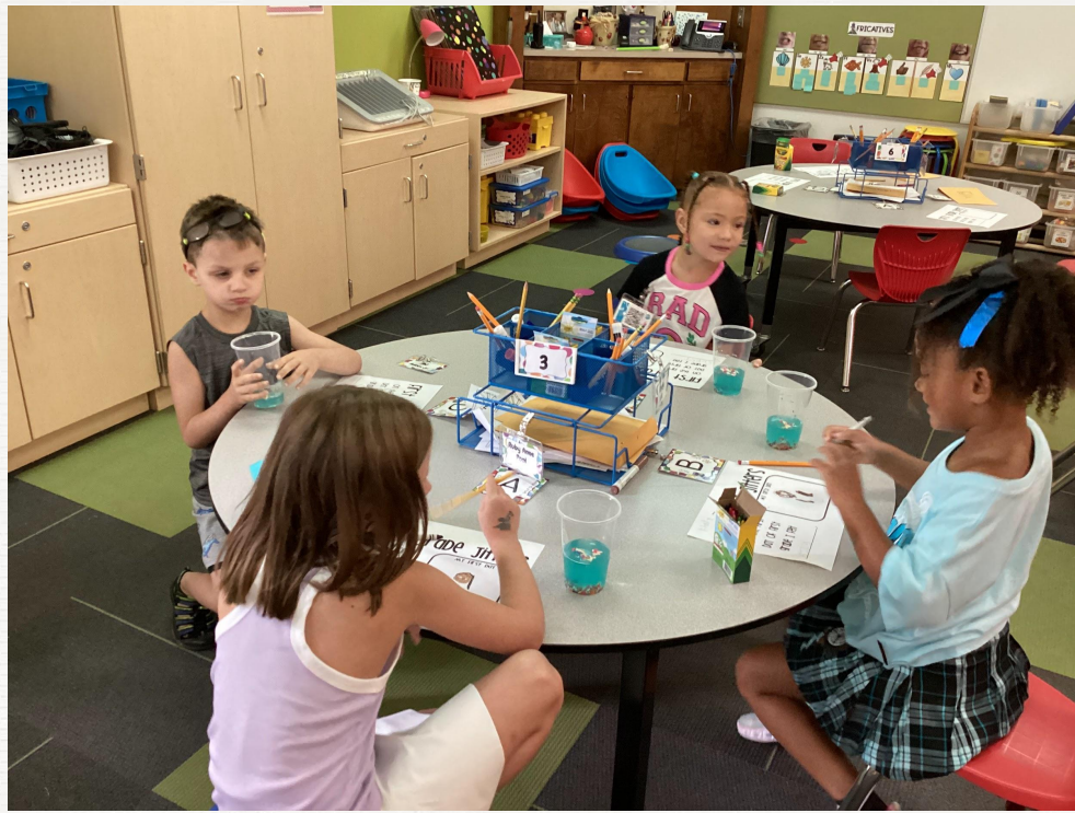
First Day of school : First Day Jitters activity with Jitter Juice.