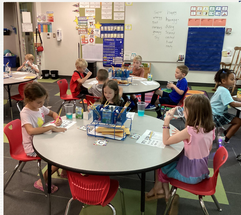
First Day of school : First Day Jitters activity with Jitter Juice.