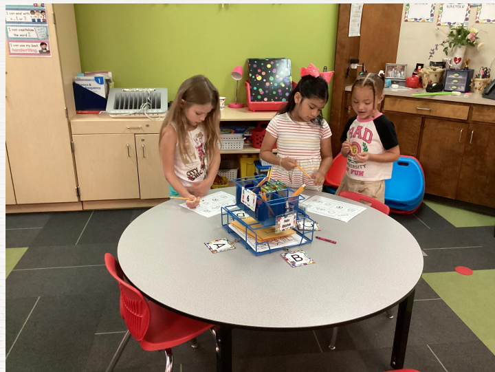
First Day of school : Find A Friend Who...activity.